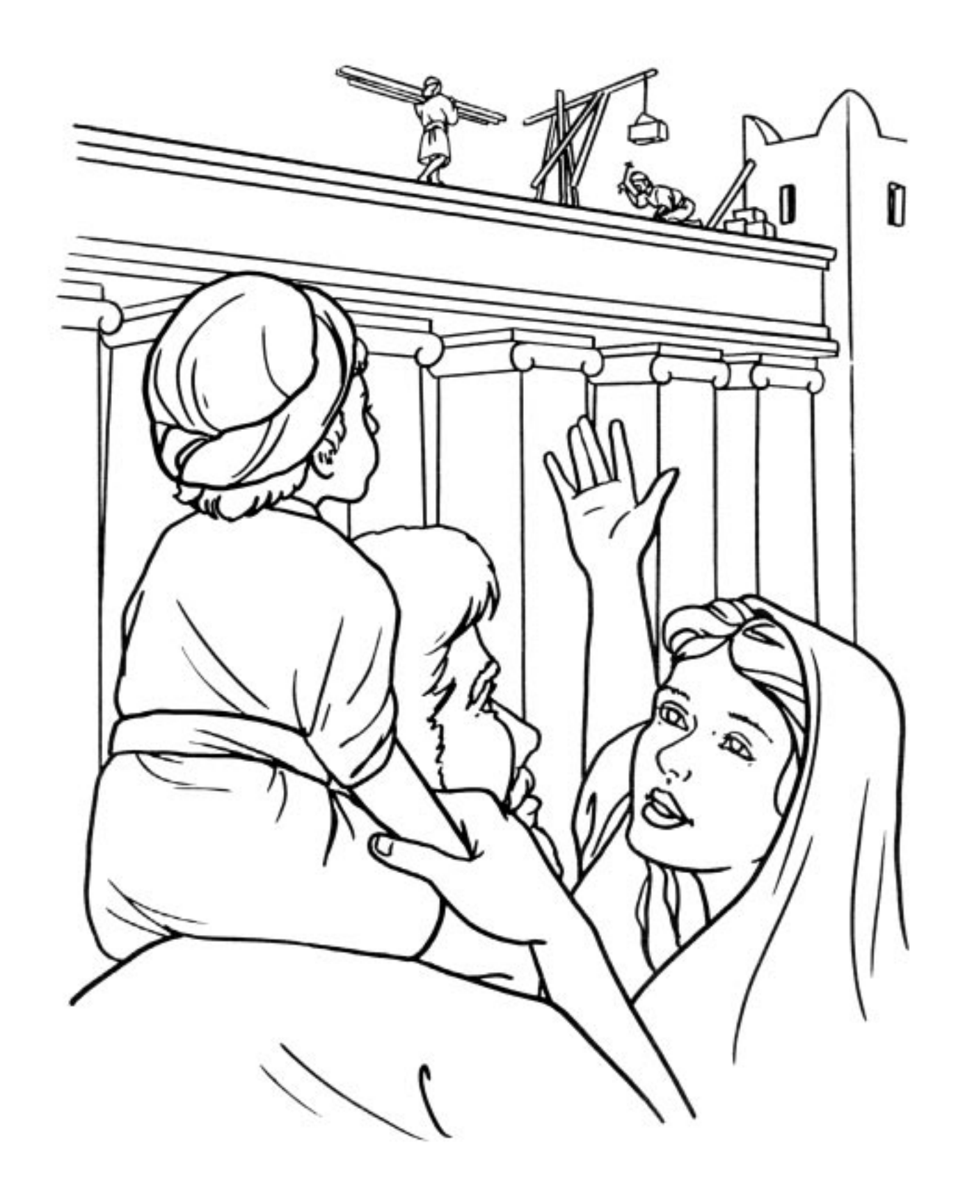
Prov. 18:10 The name of Adonai is a strong tower; The righteous runs into it and is safe.