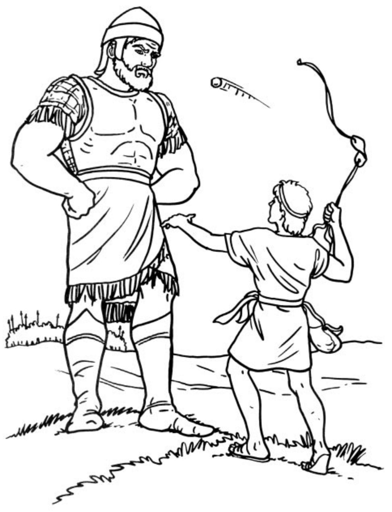
1Sam 17:45 Then David said to the Philistine, "You come to me with a sword, a spear, and a javelin, but I come to you in the name of Adonai of hosts, the G-d of the armies of Israel, whom you have taunted.