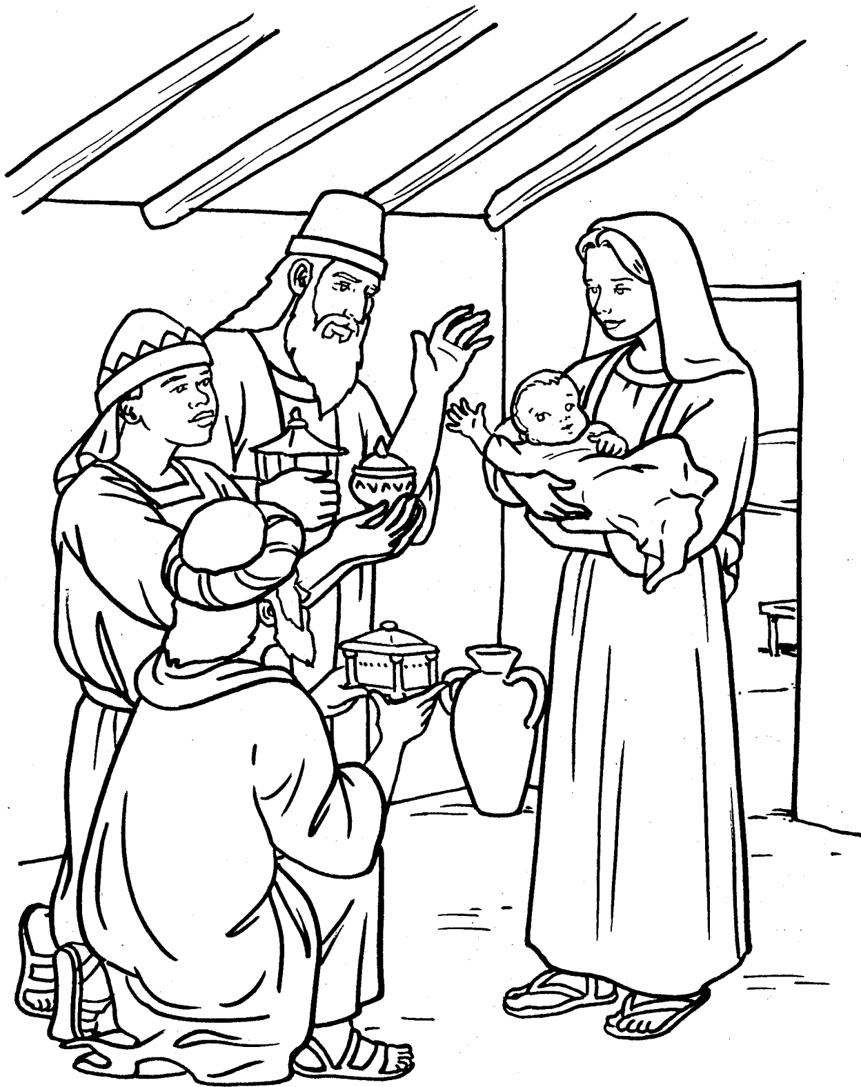
WISE MEN VISITED YOUNG JESUS. MATTHEW 2:11